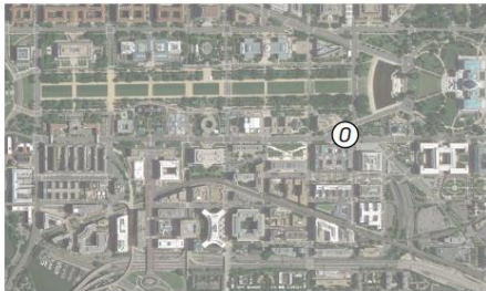
Viable Site O: Maryland & Independence Avenues at 3rd Street SW

Site Location: Southwest Site Size: ~0.31 acres Area I Location: Yes