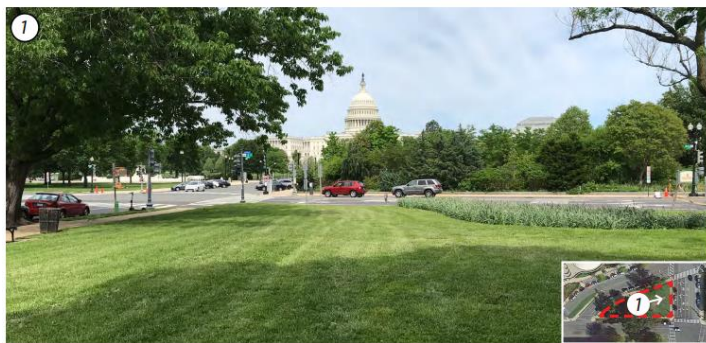
1: View northeast