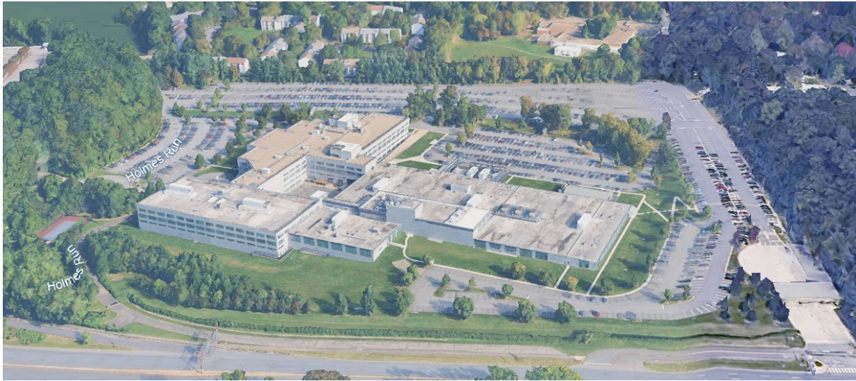
Figure 1: Oblique Campus View (Image Credit: Google Earth)