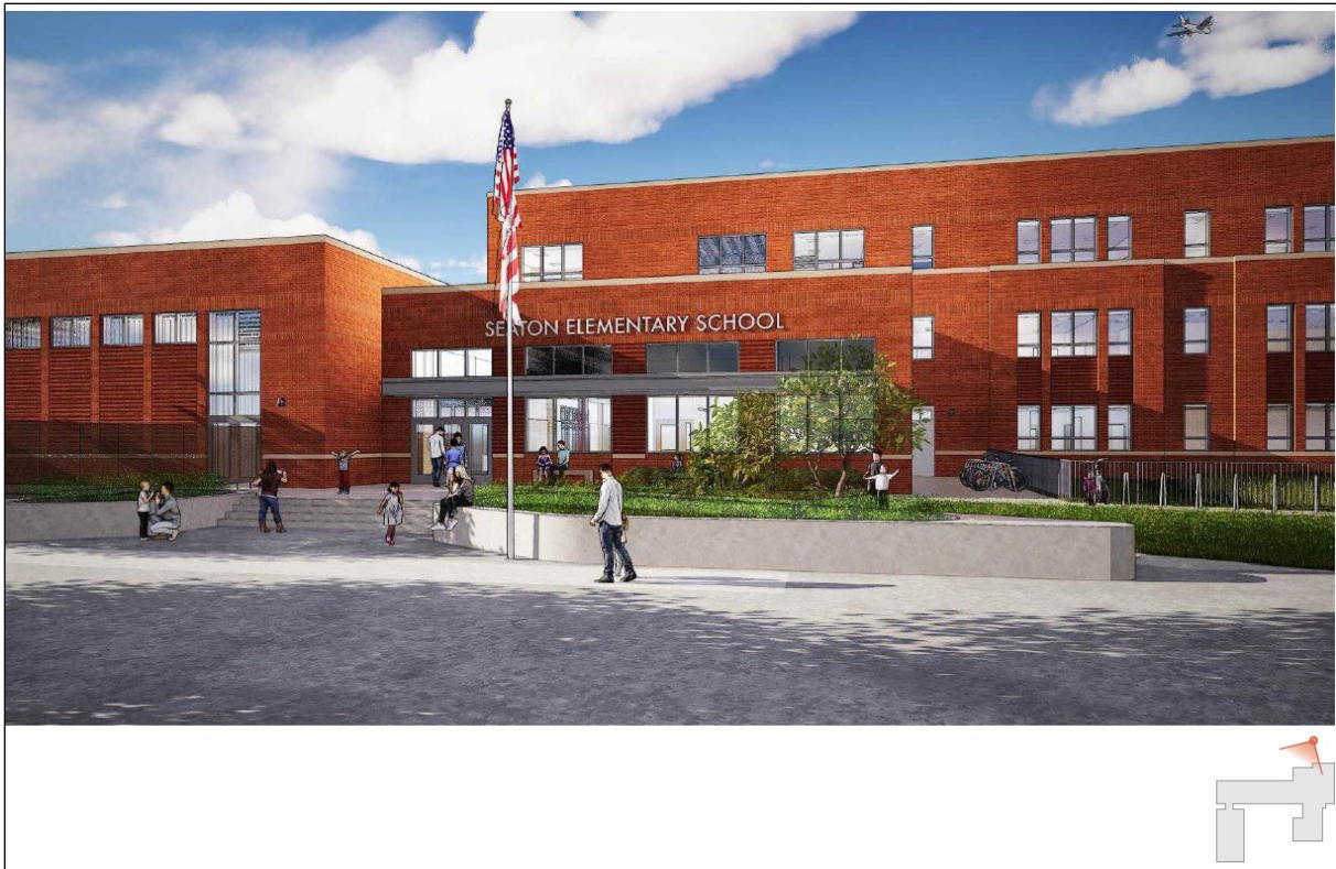
Figure 1: Front Façade Rendering

The project is required to be net zero to comply with DC Building Code. Due to the compatibility of this goal with the existing envelope, the modernization proposal includes removing most non-structural walls and roof treatments. Additionally, the octagonal pre-K wing is to be removed in full and replaced with a new student dining addition. The recessed entry is to be removed and replaced with a welcome center and entry that projects outward, without extending beyond the existing cafeteria / gymnasium (east wing). New construction will receive new sheathing and insulation to meet contemporary standards, increase student and staff capacity by over one third, and improve circulation along with communal spaces.