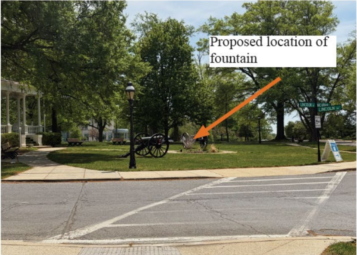
Image 5: Image 4: View of project site looking southeast from the Administration Building (Building 10)