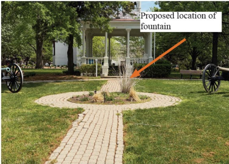
Image 3: View of project site looking east from the sidewalk toward the Bandstand