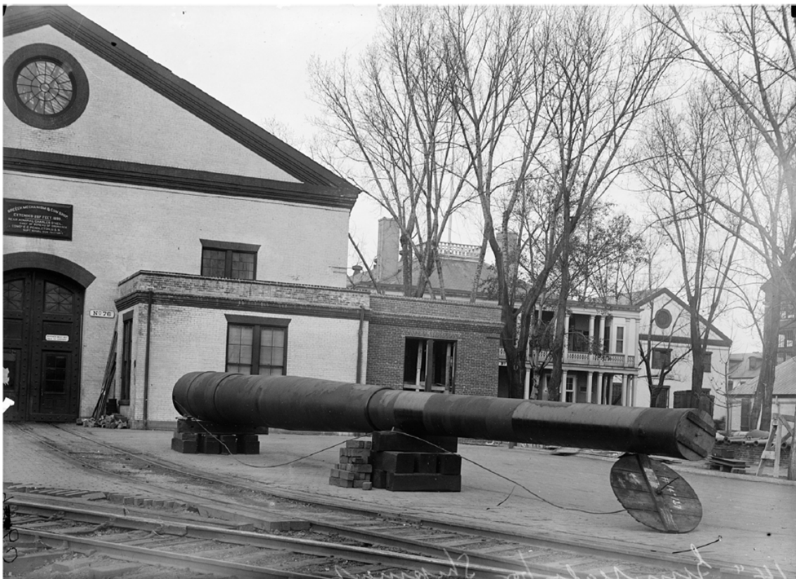
Figure 1: Front façade historic photograph.

Fine Arts (CFA), and the Washington Metropolitan Area Transit Authority. The Committee forwarded the proposed preliminary site and building plans to the Commission with the statement that the proposal was coordinated with some, but not all, participating agencies. The DC SHPO is still engaged in the project's review but determined that the undertaking will have an adverse effect on the historic building and the surrounding Washington Navy Yard National Historic Landmark District. It is coordinating, however, subject to completion of the Section 106 process. DC SHPO requested that any unavoidable adverse effects be mitigated by the complete and historically accurate restoration of Building 76's primary (southern) elevation based upon the historic image identified in previous correspondence. DOEE is not coordinated and requested that the applicant contact it to schedule a preliminary design review meeting as work will likely trigger stormwater requirements. It noted that the applicant seems to be aware of DOEE stormwater requirements and has a plan to meet the stormwater retention volume. CFA staff noted that the project is on its April 16 consent agenda. DCOP staff asked if there was any discussion about the process to remove the paint. NCPC said that SHPO, as part of the Section 106 process, recommended that the building's main façade be repainted in the original color.