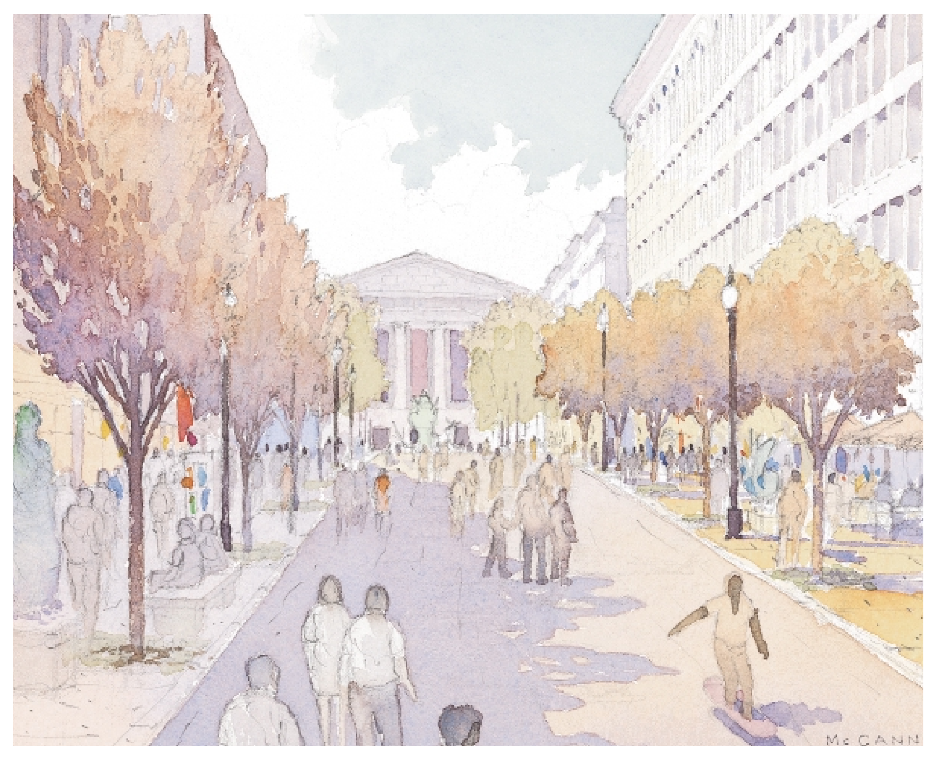
The 8th Street, NW arts district will stimulate downtown economic growth.