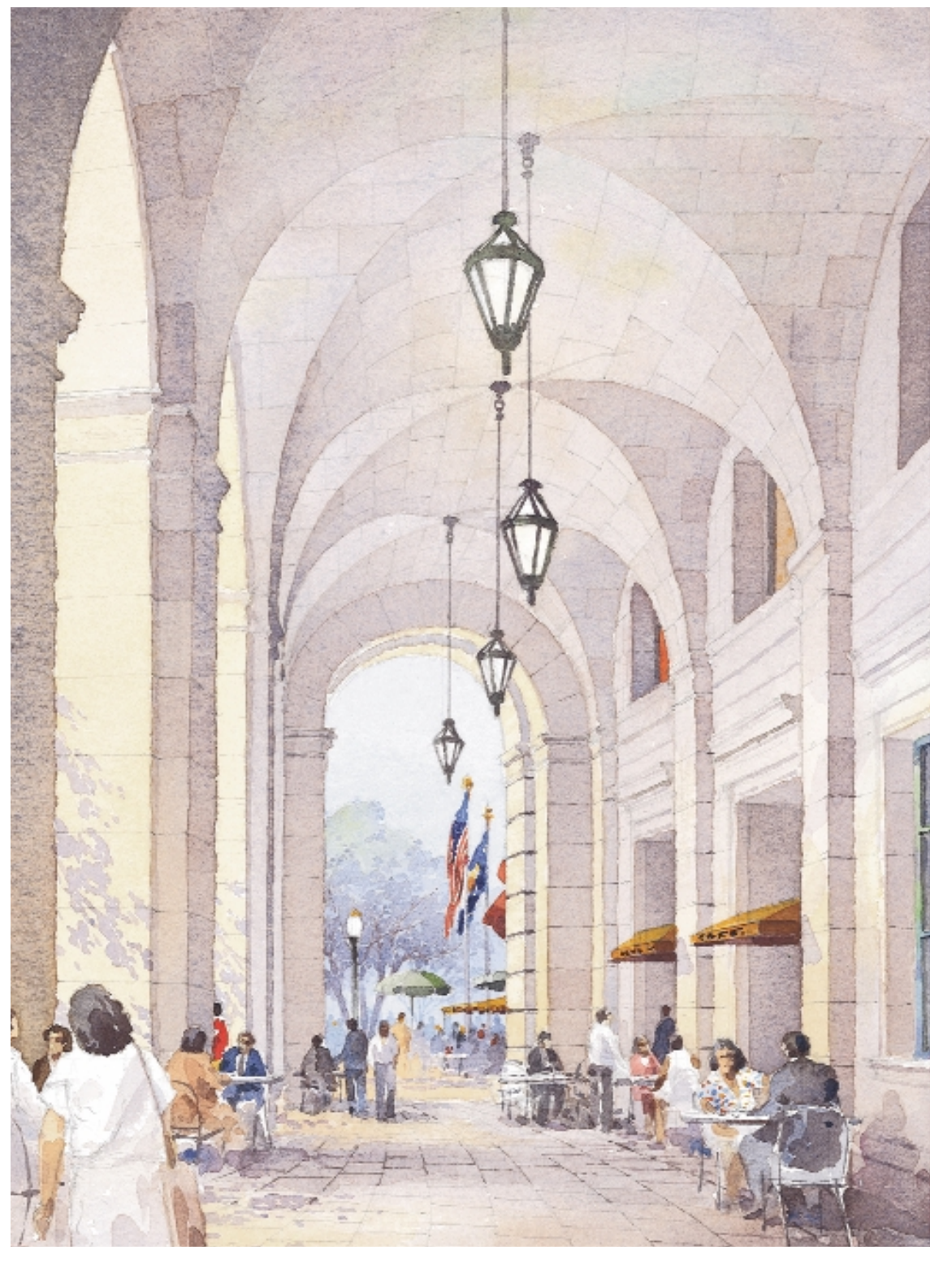
New and existing federal buildings can be enlivened with gardens, cafés and art exhibits.