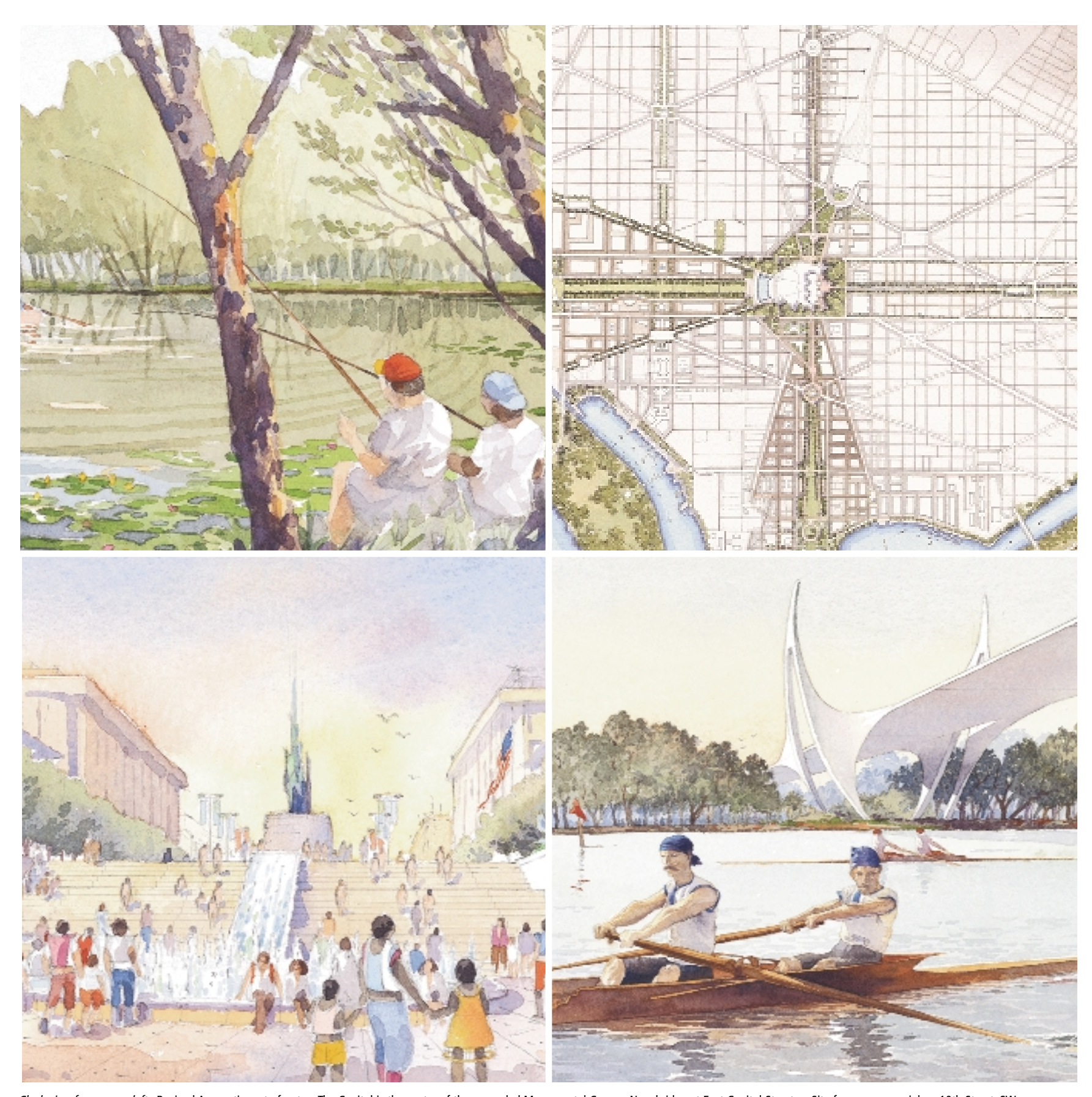
Clockwise, from upper left: Revived Anacostia waterfront • The Capitol is the center of the expanded Monumental Core • New bridge at East Capitol Street • Site for new memorial on 10th Street, SW