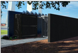
U.S. Air Force Memorial Ceremonial Storage (6.)