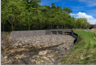
Piney Branch Tunnel Project (1.)