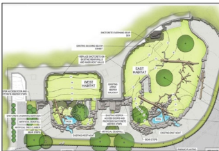
Lower Bear Habitat (2.)