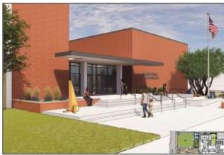
J.O. Wilson Elementary School (3.)