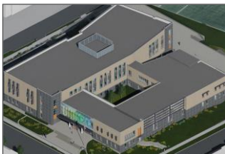
Tubman Elementary School (4.)