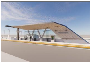
Richmond Highway Station (2.)