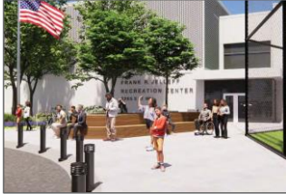
Jelleff Recreation Center (1.)