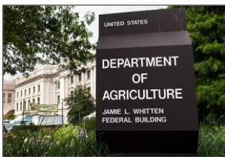
U.S. Department of Agriculture (2.)