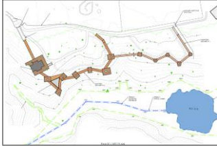
Elevated Canopy Trail (1.)