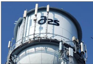
T-Mobile Antenna Modification (3)