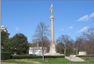
First Infantry Division Memorial