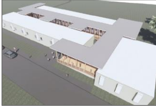
LEARN Charter School (2)