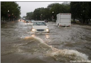
Federal Flood Risk Management

Staff submitted NCPC's Implementation Plan for EO 14019, Promoting Access to Voting to the Office of Management and Budget. Staff is currently responding to EO 14008, On Tackling the Climate Crisis at Home and Abroad, which includes implementation of EO 13690, Establishing a Federal Flood Risk Management Standard.