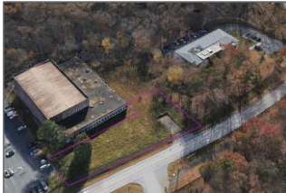
Food and Drug Administration (2)