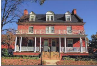
Army Family Housing Renovation Program (1)

Following adoption of the Transportation Element at the July Commission, staff worked on the action item to develop the Transportation Management Plan monitoring form in the Submission Portal and communicating with stakeholders on when the new element policies will go into effect, which was September 14, 2020. Staff continues to develop the Federal Workplace Element and will submit it for Commission adoption later this year.