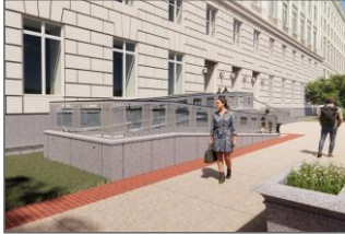
Internal Revenue Service Building (1.)