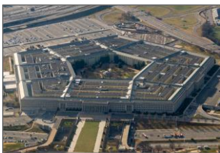
Pentagon Center Courtyard Stage (3.)