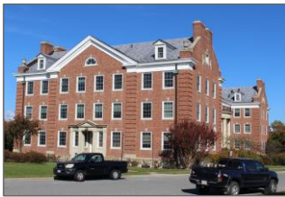
BARC Building 005 (4.)