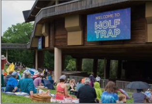
Wolf Trap National Park for the Performing Arts