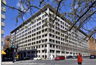
Patrick Henry Building (1)