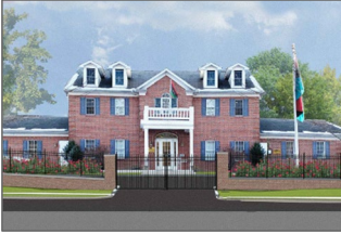
Chancery of Libya