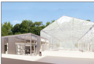
Smithsonian Institution's Botany Greenhouse (7)