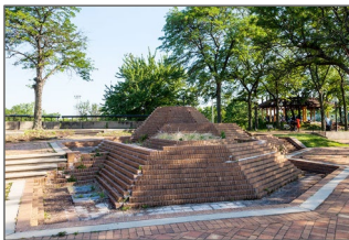
Fort Lincoln Park (4)