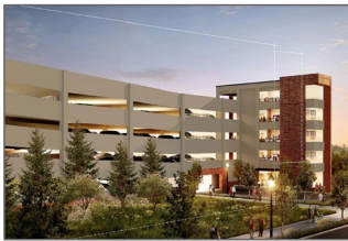
St. Elizabeths East Campus Parking Garage (6)