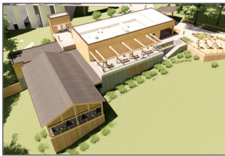
Wolf Trap Concession Stand A (3.)