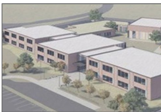
LEARN Charter School (2.)