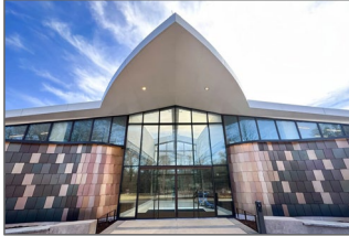
Great Flight Aviary (1.)