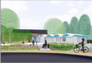
2412 Rand Place, NE (1.)