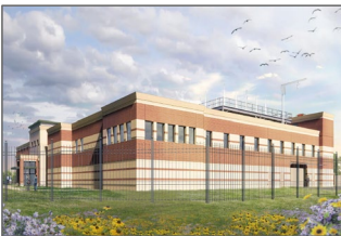
Joint Base Anacostia-Bolling (3.)