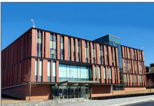
2701 Martin Luther King Jr. Avenue, SE (4.)