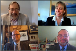
NCPC's April 29 online meeting