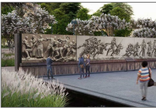
National World War I Memorial (5)