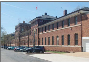
Marine Barracks, Building 8 (4)