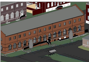
Fort McNair (7)