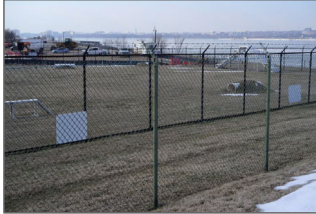
JBAB Perimeter Security Fence (1.)