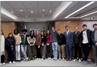
University of Albany visit

On February 19, the Monumental Core Interagency Working Group (IWG) held their quarterly meeting where it reviewed the draft Monumental Core Streetscape Guide and Construction Manual (Streetscape Guide). The Streetscape Guide includes an urban design streetscape framework, streetscape design guidelines, construction details and specifications, and guiding principles for the planning, design, and construction of streetscapes within the monumental core. The IWG was also briefed by the Washington Metropolitan Area Transit Authority (Metro) on flood-vulnerable vent shafts located throughout the monumental core. Currently, sandbags are utilized to prevent these vents from flooding during storm events. In the coming months, IWG agencies will coordinate with Metro to discuss potential design solutions for addressing these flood concerns.