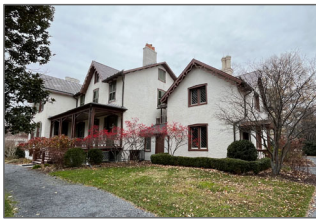
President Lincoln's Cottage (1.)