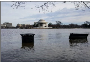
Tidal Basin flooding