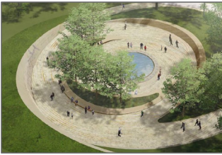
National Desert Storm and Desert Shield Memorial