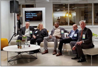
Public Space/Private Ground discussion group