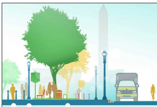
Monumental Core Streetscape Framework and Lighting Policy

Comprehensive Plan for the National Capital Federal Elements