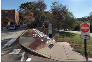
Rock Creek Park Capital Bikeshare Station (1)