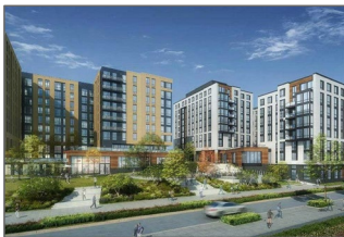
First Street, NW Right of Way (4)