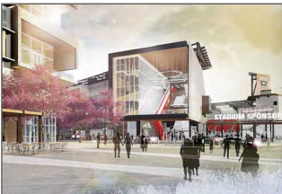
Buzzard Point