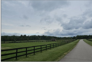
Lower Potomac Field Station