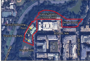
Francis Field (1.)