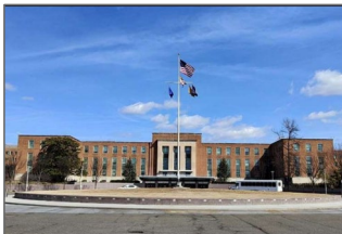
(4.) FDA White Oak