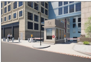
(1.) Prettyman Courthouse