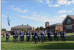
Joint Base Anacostia-Bolling (1.)