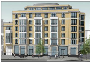
Campus Master Plan (4.)