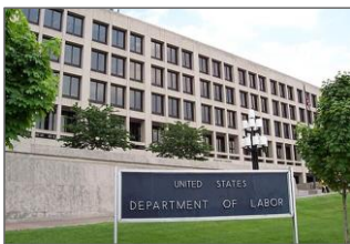
Frances E. Perkins Federal Building (2.)