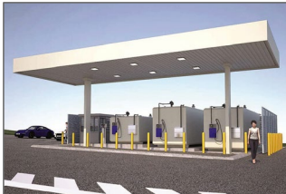
Government Vehicle Fueling Facility