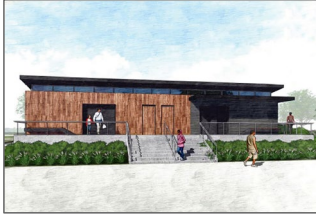
RFK Campus - New Restroom Building