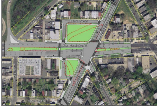
Pennsylvania Avenue, SE and Minnesota Avenue, SE intersection