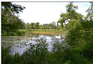
Wetlands and Floodplains

Staff reviewed and provided comments on the draft Prince William Innovation Park Small Area Plan. The plan proposes a mobility strategy which anticipates improved access to the Federal Bureau of Investigation Washington Field Office which is located within the Innovation Park area. The small area plan also encompasses multiple watersheds, including areas designated as Federal Emergency Management Agency 100-year floodplains and Chesapeake Bay Resource Protection Area zones.