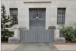
Robert F. Kennedy Federal Building Flood Barrier (1)