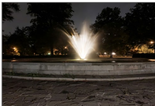
Chevy Chase Circle Fountain (3)