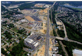
Prince William County

On Friday, May 29 the Interagency Working Group met to review draft street tree guidelines that address tree canopy, form, planting patterns, and sensory attributes. These features contribute to community identity, add beauty and shade, strengthen important views, and add economic value. The health and function of trees contributes to the city's 40 percent tree canopy coverage goal; provide habitat for typical wildlife, reduce water, air, and noise pollution; produce oxygen; and absorb greenhouse gases. Over the summer, the working group will begin considering streetscape stormwater management guidelines.