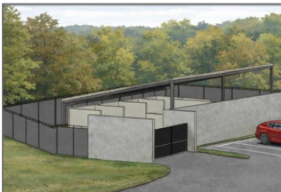
(11.) NSF-Carderock Building 157 Lithium Battery Storage Facility