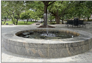
John Marshall Park Wellspring