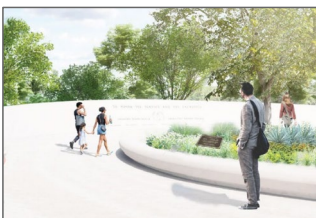
(1.) National Desert Storm and Desert Shield Memorial Donor Recognition Plaques

During the past month, NCPC staff determined that the following projects are exempt from Commission review, based on certain criteria. Unless otherwise noted, all projects are in Washington, DC.