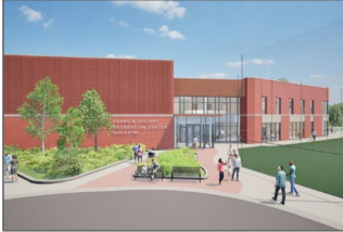
(6.) Jelleff Recreation Center

During the past month, the Executive Director took the following actions under the Commission's delegation authority. Unless otherwise noted, all projects are in Washington, DC.