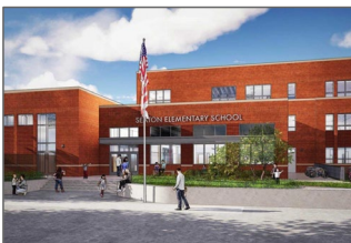
(7.) Seaton Elementary School