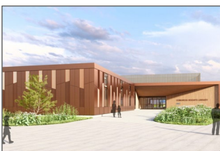
(5.) New Congress Heights Library