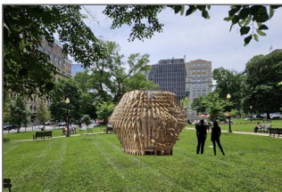
Farragut Square Temporary Public Art (4.)