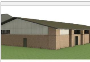
Joint Base Andrews West Fitness Center (7.)