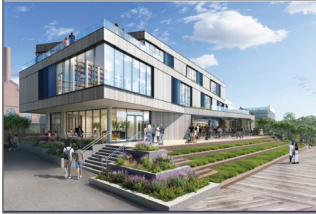
Southeast Federal Center Parcel P3 (1.)