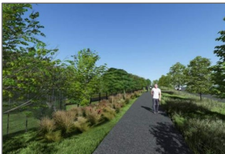
FDA Submerged Gravel Wetland (6.)