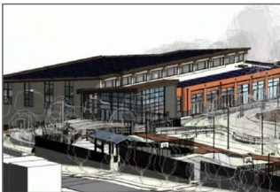
Fort Davis Community Center (5.)