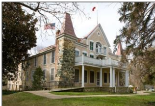
Clara Barton National Historic Site (6.)