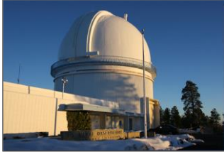
U.S. Naval Observatory (1.)