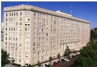
Veterans Administration (2.)