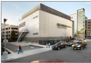
National Institutes of Health (5.)