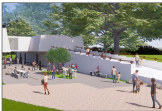
Great Falls Visitor Center (3.)