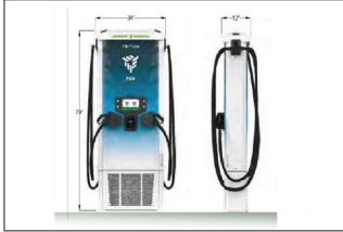
Electric Charging Station Pilot Project (2.)