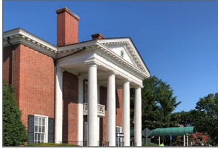
Fort McNair (1)