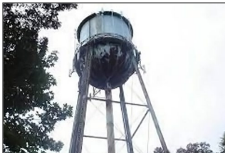
Beltsville Agricultural Research Center Water Tower (5)