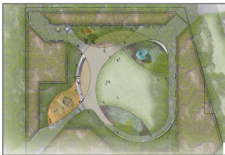
O Street Park (2)