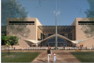
FCIP, National Air and Space Museum