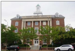
Martin V.B. Bostetter, Jr. U.S. Courthouse (6)