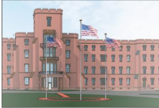
St. Elizabeths' Center Building (1)