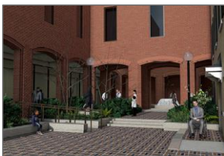
Howard T. Markey National Courts Building (3)