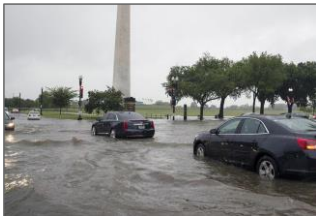
Monumental Core Stormwater Management

Staff developed the Fiscal Year 2020-2025 Federal Capital Improvement Program for the National Capital Region Funded Report (FCIP) . The report identifies projects listed in the FCIP that have subsequently received Congressionally authorized funding. The report includes 25 projects with a total estimated cost of more than $875 million. Some of the projects highlighted in the report include $200 million for the Armed Forces Retirement Home Master Plan Implementation; $274 million for the Department of Health and Human Services, National Institute of Health Surgery Radiology Laboratory Medicine facility; $95 million for the modernization of the General Services Administration Regional Office Building; and $135 million for the Smithsonian Institution's National Air and Space Museum Revitalize Building Envelope and Infrastructure project. The final report will be available in August.