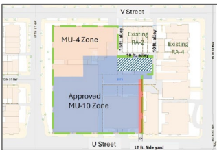
Text Amendment ZC 23-26 (2.)