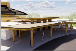
Wolf Trap Park (1.)