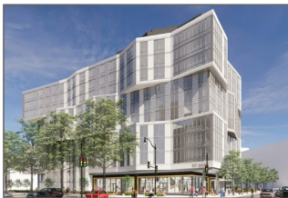
Square 439S (2.)