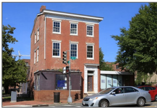
Square 449 (3.)