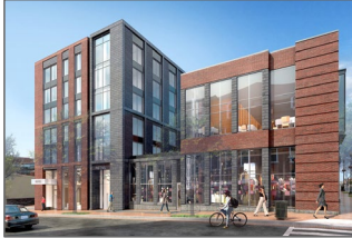
Square 1197 PUD (1.)