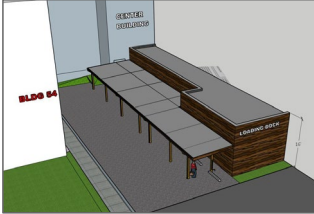
Electric Vehicle Cart Shelter (1.)