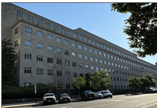
Government Accountability Office (2.)