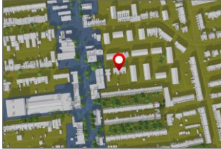
Map Amendment at Square 3040 (.1)