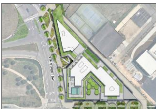
899 Maine Avenue, SW (2.)