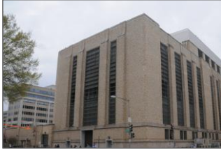
GSA Central Heating Plant (1.)