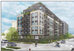
1707 8th Street, NW (3.)