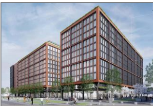
Capitol Gateway (2.)