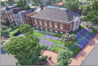
Southeast Neighborhood Library (1.)