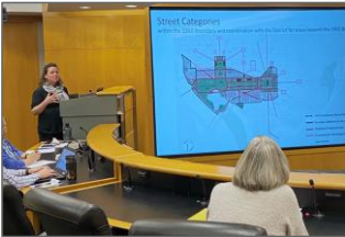
Streetscape &amp; Lighting