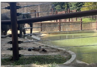
Zoo Elephant Yards (2.)