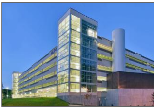
NIH Garages (4.)