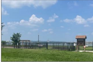
Joint Base Anacostia-Bolling Dog Park (1.)