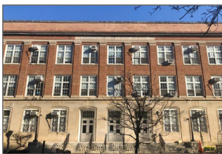
School Without Walls (2.)