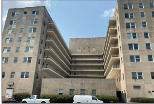
Sheridan Building Renovations (1.)