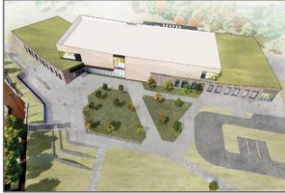
Fort Lincoln Park Community Center (1.)