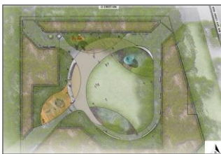
New Jersey Avenue and O Street Park (2.)