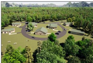
Fort Belvoir Recreational Cabins (3.)