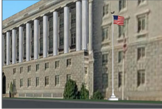
Internal Revenue Service Federal Building (1)