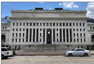
Carnegie Library (4)