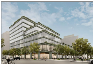
Southeast Federal Center Parcel F (2)