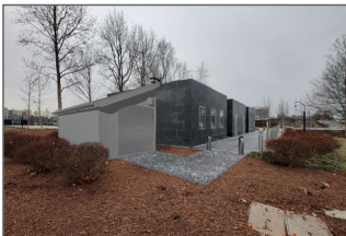
U.S. Air Force Memorial Ceremonial Storage (3.)