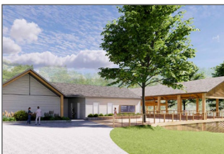
Wolf Trap Building Replacement (4.)