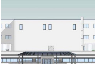
VA Medical Center Oncology and Cancer Center (1.)