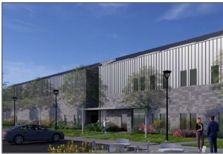
NIH Animal Center Building 102 (2.)