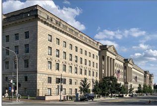
Herbert C. Hoover Federal Building (1.)