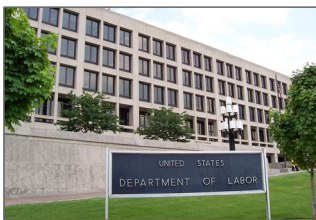
Frances E. Perkins Federal Building (2.)