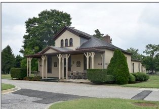
Fort McNair Building 17 Renovation (4.)