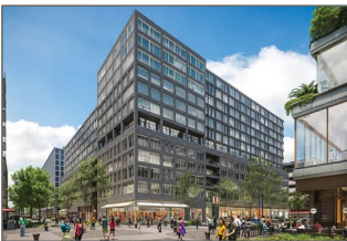
Southeast Federal Center (3.)