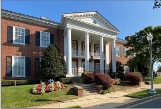
Fort McNair Building 60 Renovation (1.)