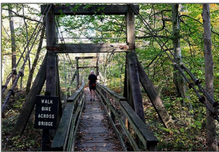
Prince William County Potomac Heritage National Scenic Trail Project