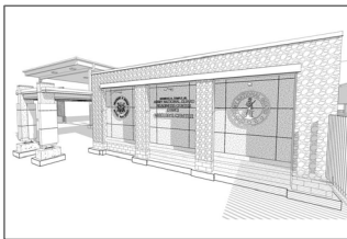
Herbert R. Temple Jr. Army National Guard Readiness Center (4)