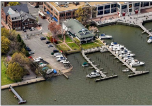
Alexandria Waterfront Small Area Plan

After a quiet winter season, spring is bringing changes to the Avenue. The National Children's Museum located at the Ronald Reagan Building and International Trade Center at 1300 Pennsylvania Avenue, NW, opened to the public on February 24. The museum, geared towards children up to 12 years old, will be open seven days a week once it is safe to do so. Construction is underway at 1001 Pennsylvania Avenue, which will include a new main entrance. The building is expected to reopen this fall. Public space improvements courtesy of the DowntownDC BID are also underway; the seasonal planters will have new annual plants, and Indiana Plaza will soon have new planters and seating for visitors to enjoy.