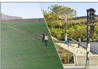
Adapting Designed Landscapes