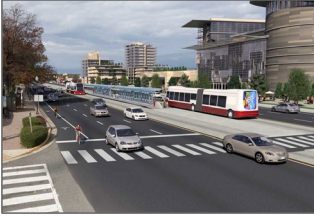
Fairfax County Richmond Highway Bus Rapid Transit Initiative