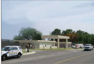
Vehicle and Pedestrian Access Control Point (1)