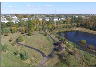
Loudoun County Linear Parks and Trails System

Staff reviewed Loudoun County's Fiscal Year 2021-2026 Amended Capital Improvement Program (CIP) to determine the program's potential impact on federal properties or other federal interests in the National Capital Region. None of the capital projects appear to have any adverse impacts and are consistent with the principles and policies of the Comprehensive Plan's Federal Elements. The CIP includes multiple projects that will improve regional mobility, which is particularly important for the effectiveness of the federal workforce. Some of the items in the CIP are the Linear Parks and Trails System, Metro Station Area Pedestrian Improvements, and Transit Buses acquisition projects, all of which support Comprehensive Plan policies related to integrated regional transit.