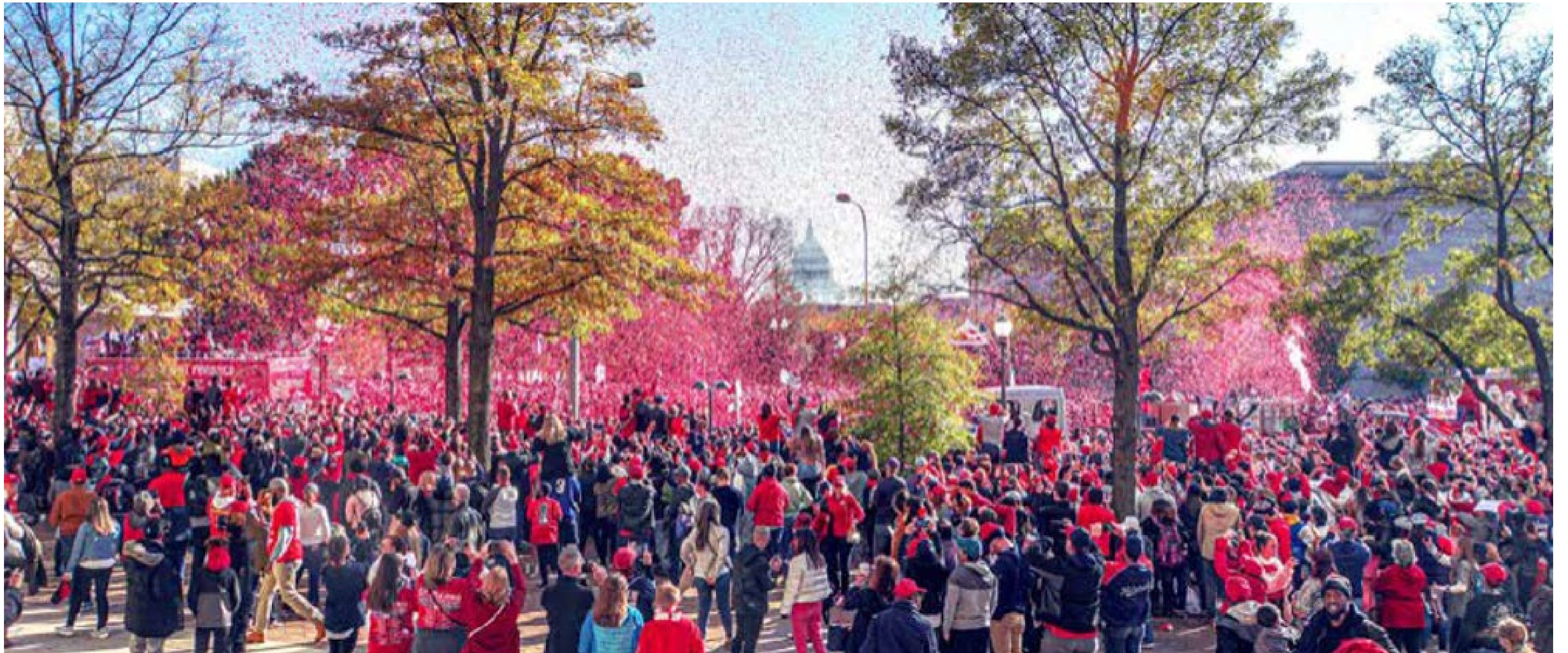
Washington Nationals World Series Victory Parade