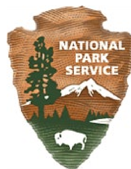
National Park Service (NPS)