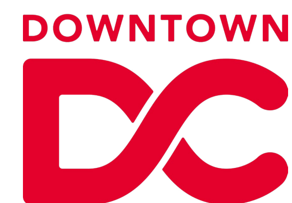
DowntownDC Business Improvement District (BID)