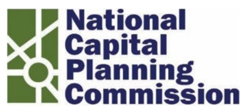
National Capital Planning Commission (NCPC)