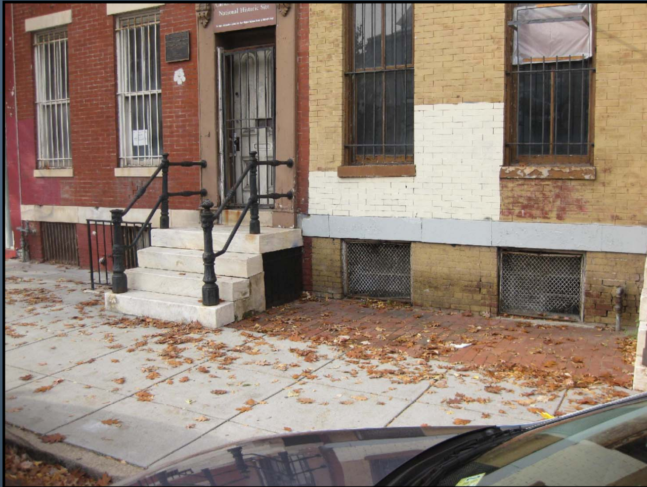
View facing southwest on 9th Street, NW with Carter G. Woodson home on left and adjacent NPS property on right