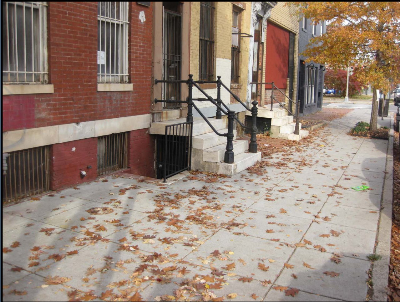
View facing north on 9th Street, NW